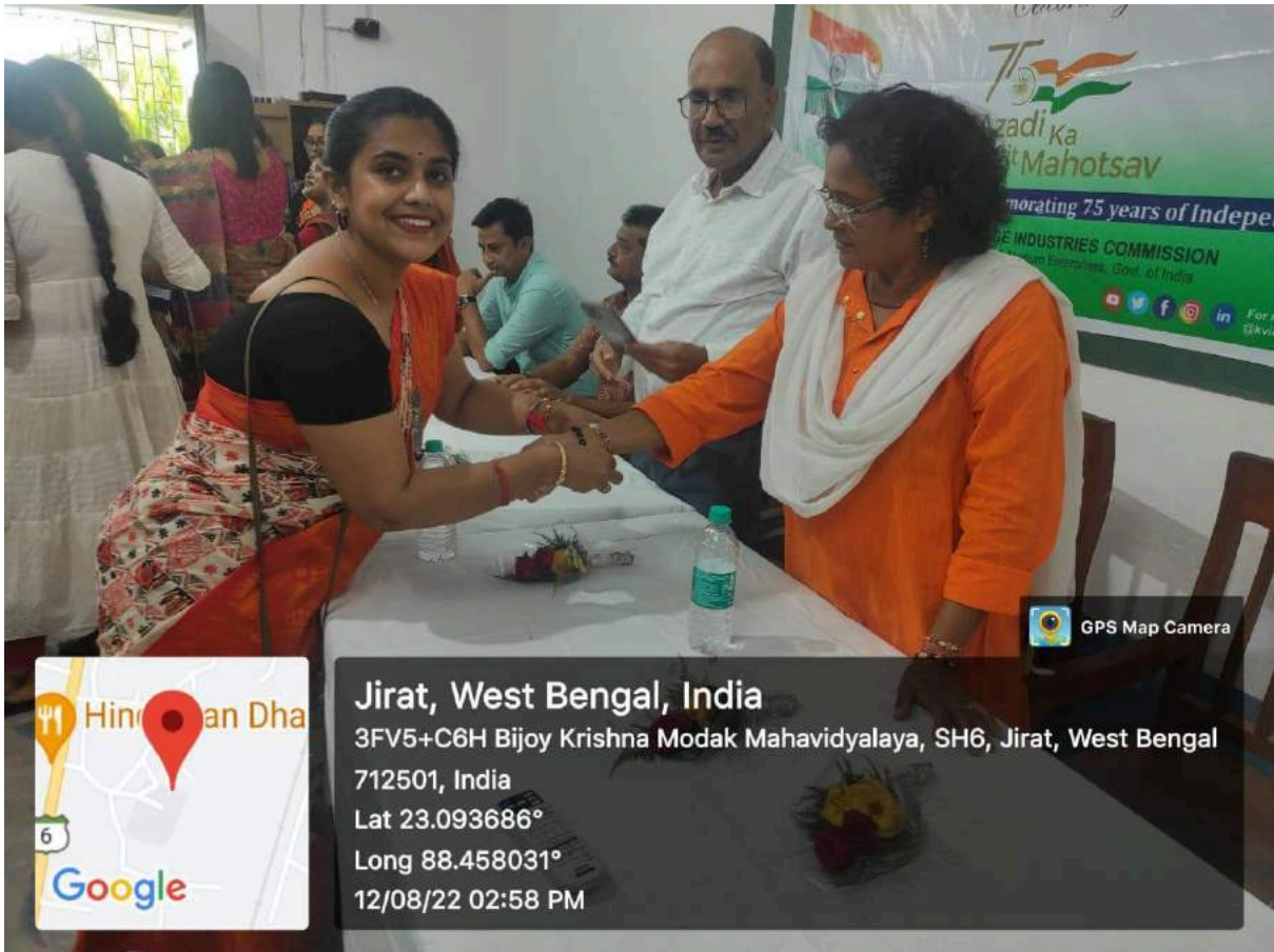
Students and teachers tying rakhi to each other