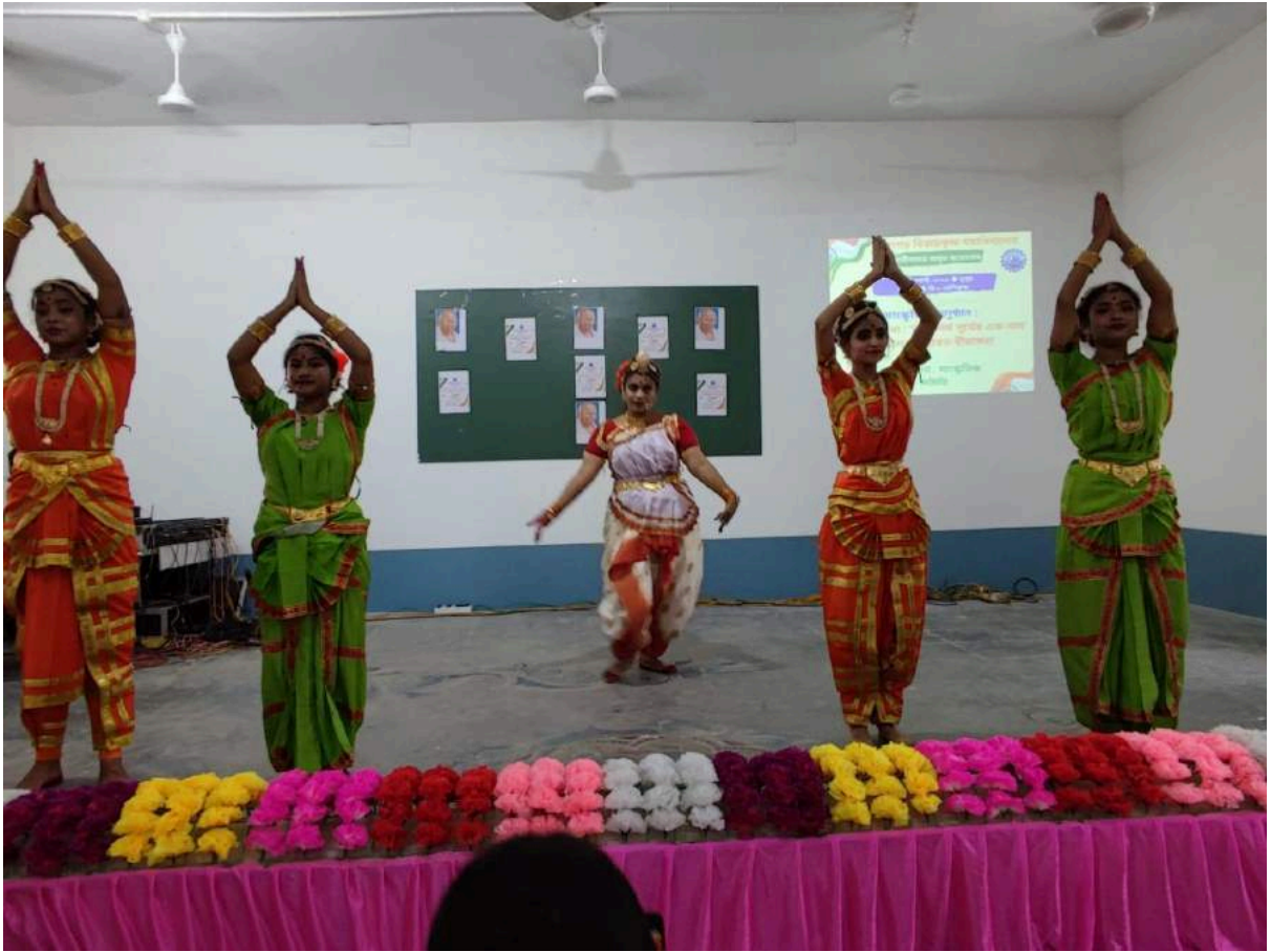
Students and teachers performing