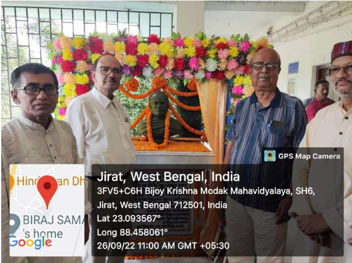
Students, faculties and the principal of the college paying respect