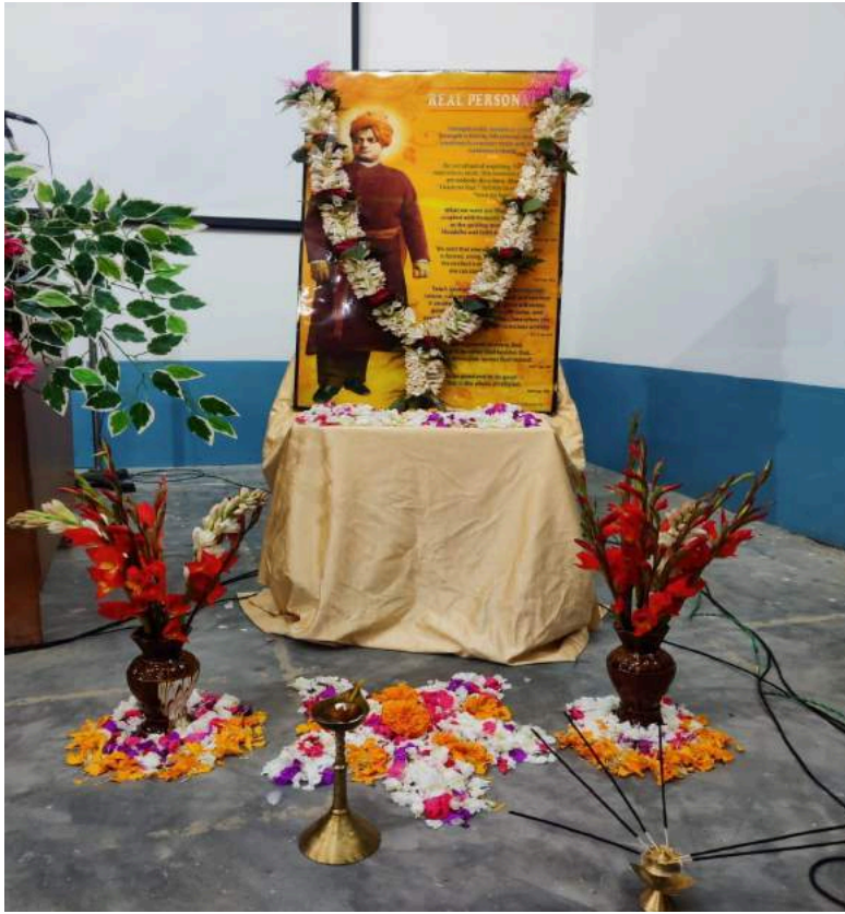
Pic.1. Chief Guest offering garland to the statue of Swami Vivekananda Pic 2. A portrait of Swami Vivekananda