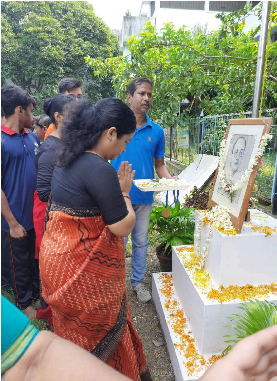
Students and Teachers paying respect