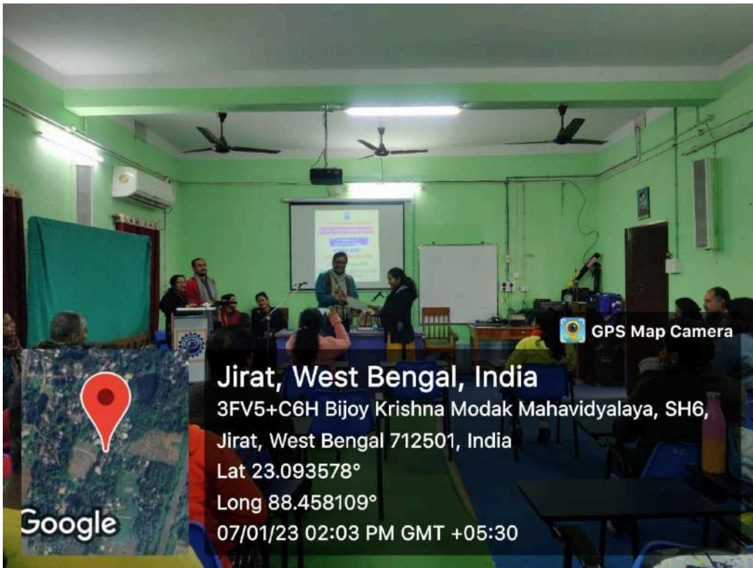
Students receiving certificate of participation