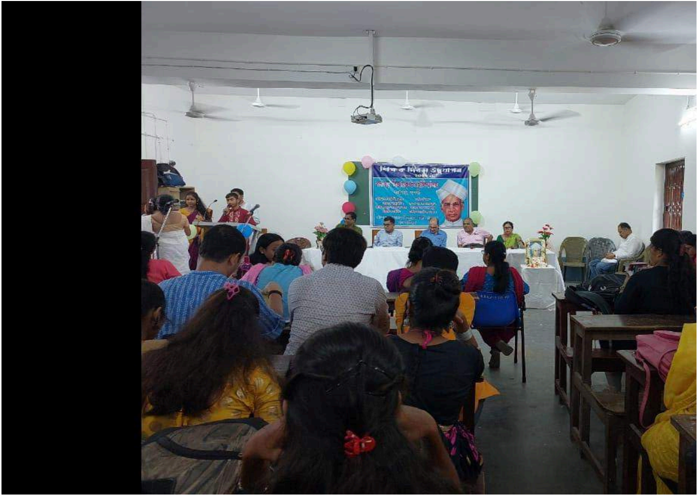
Students delivering speeches