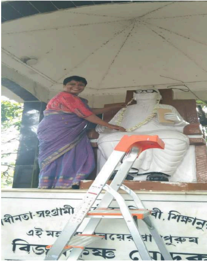
Faculty paying respect to the founder of the college