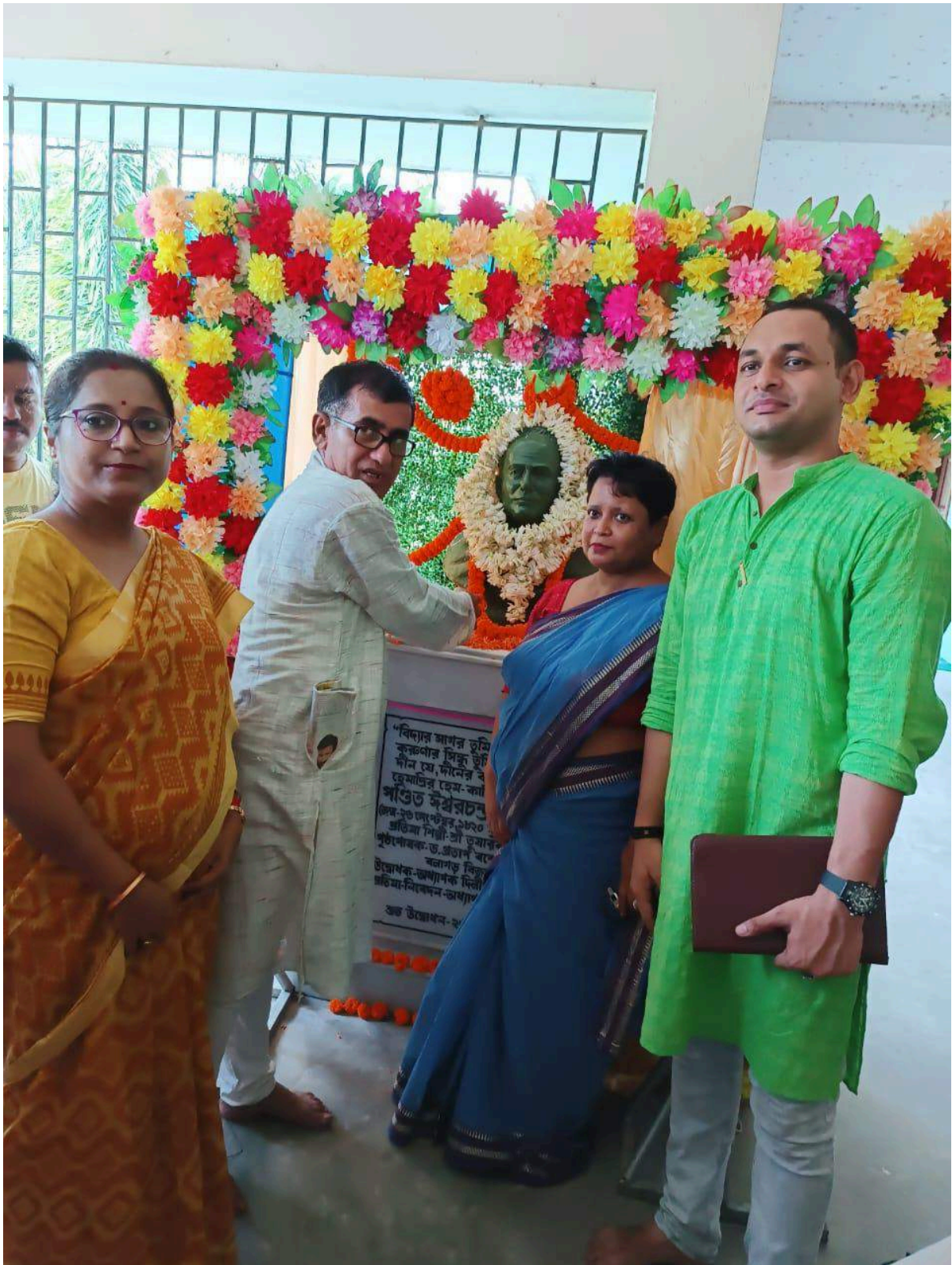
Students, faculties and the principal of the college paying respect