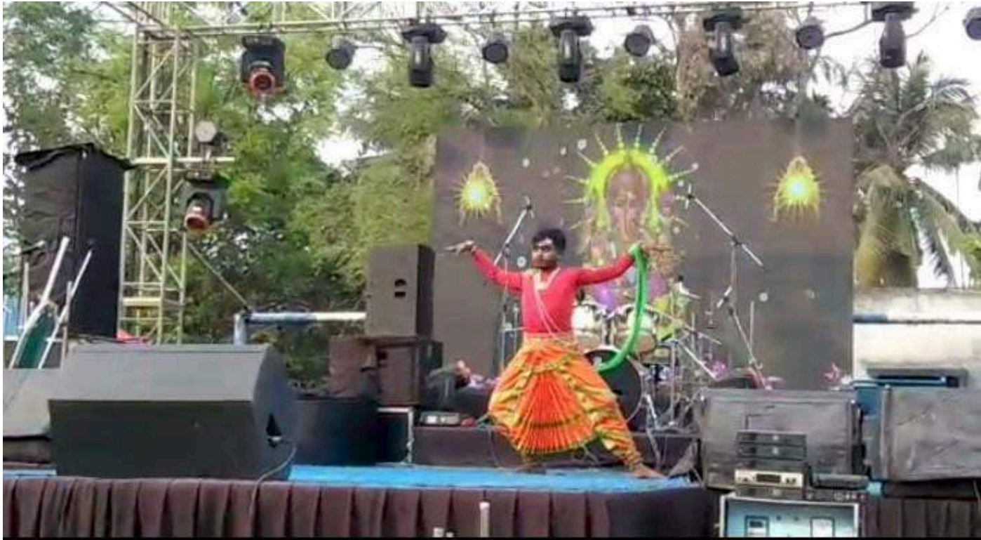
Students performing in annual cultural programme