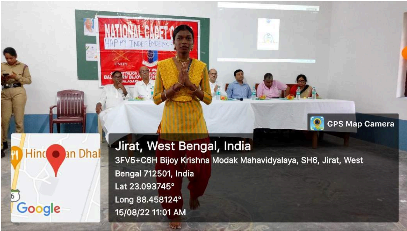
Students Celebrating Independence and Kanyashree