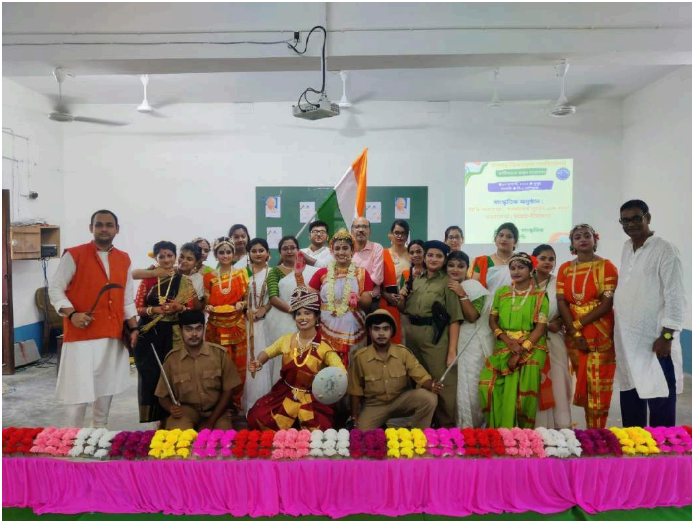
Students, faculties as performers