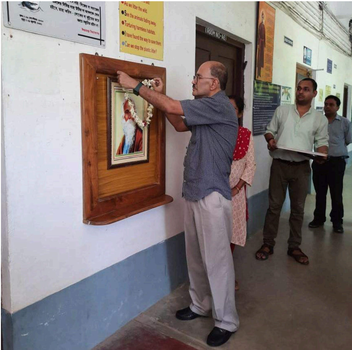
The principal of the college offering garland to the poet Rabindranath Tagore