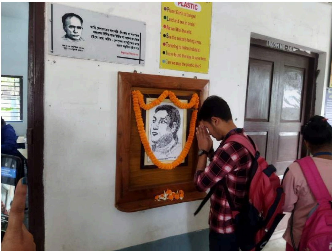
Students paying respect to the poet

Rangalal Bandyopadhyay’s birth anniversary is celebrated with offering garlands on the photo of the renowned Bengali poet, along with opening speeches given by the college principal and poetry readings and speeches delivered by student participants and faculties. The number of participants was 3.