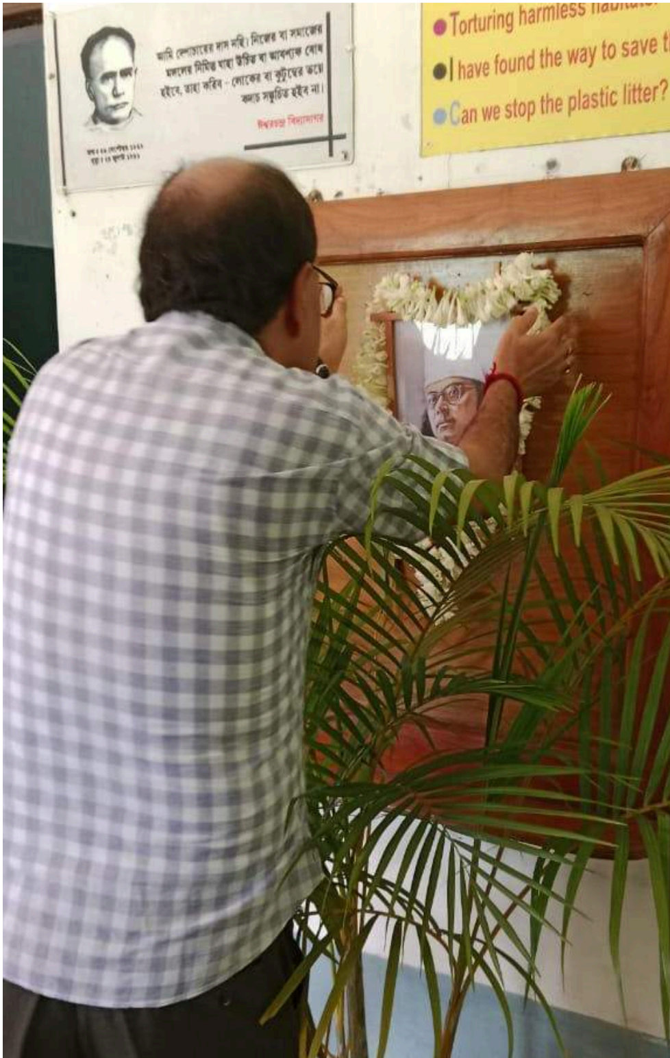
College principal offering garland to the photo of Kazi Nazrul Islam