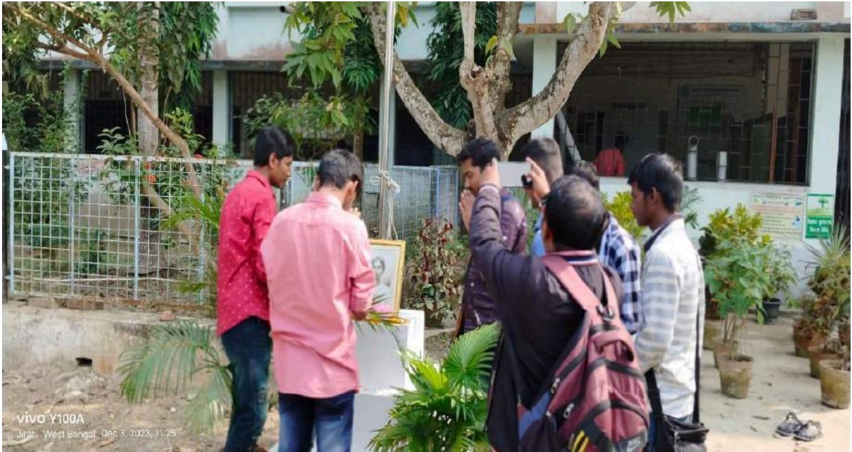
Students paying respect to the freedom fighter