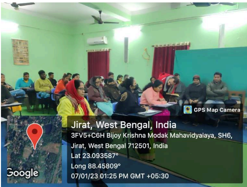
Students participating in Competition