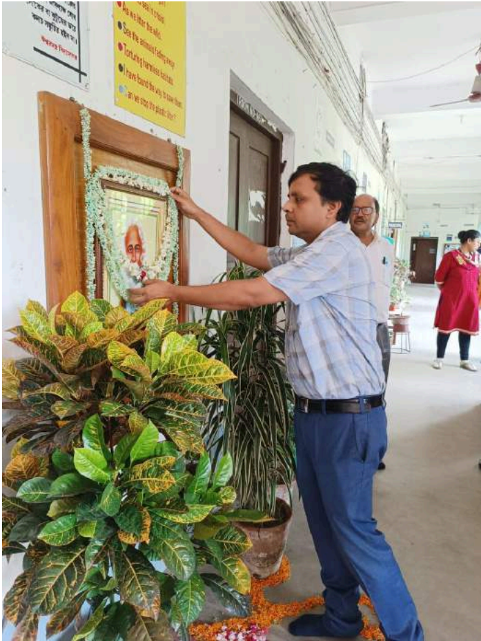
Celebrating the birth anniversary of Rabindranath Tagore