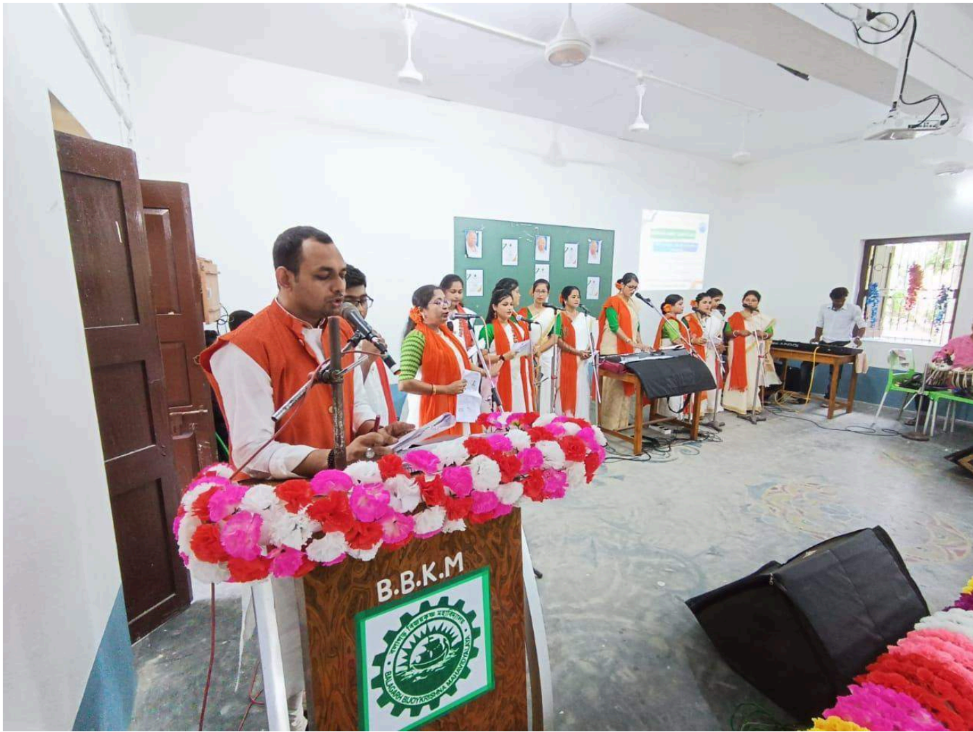
students and teachers performing