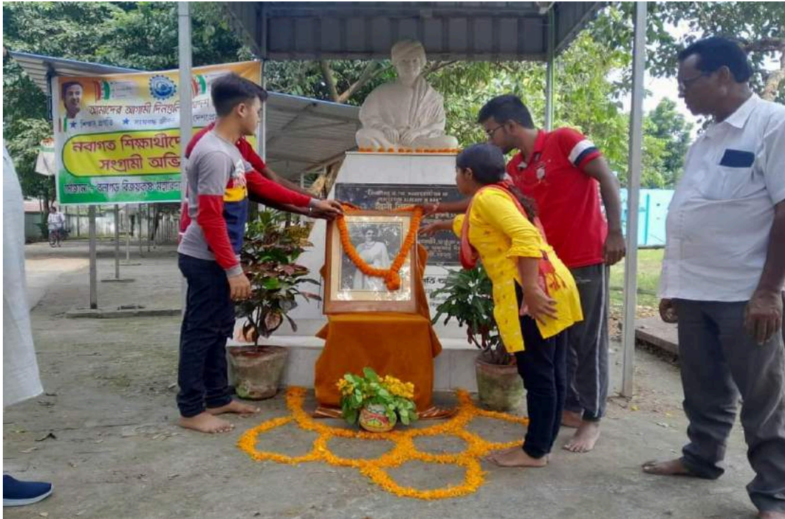
Students paying respect to the social reformer