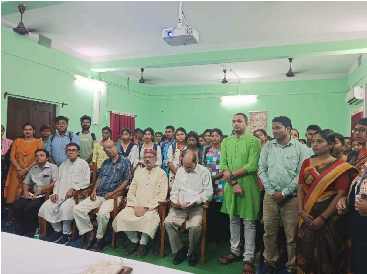
Students, faculties and the principal of the college paying respect