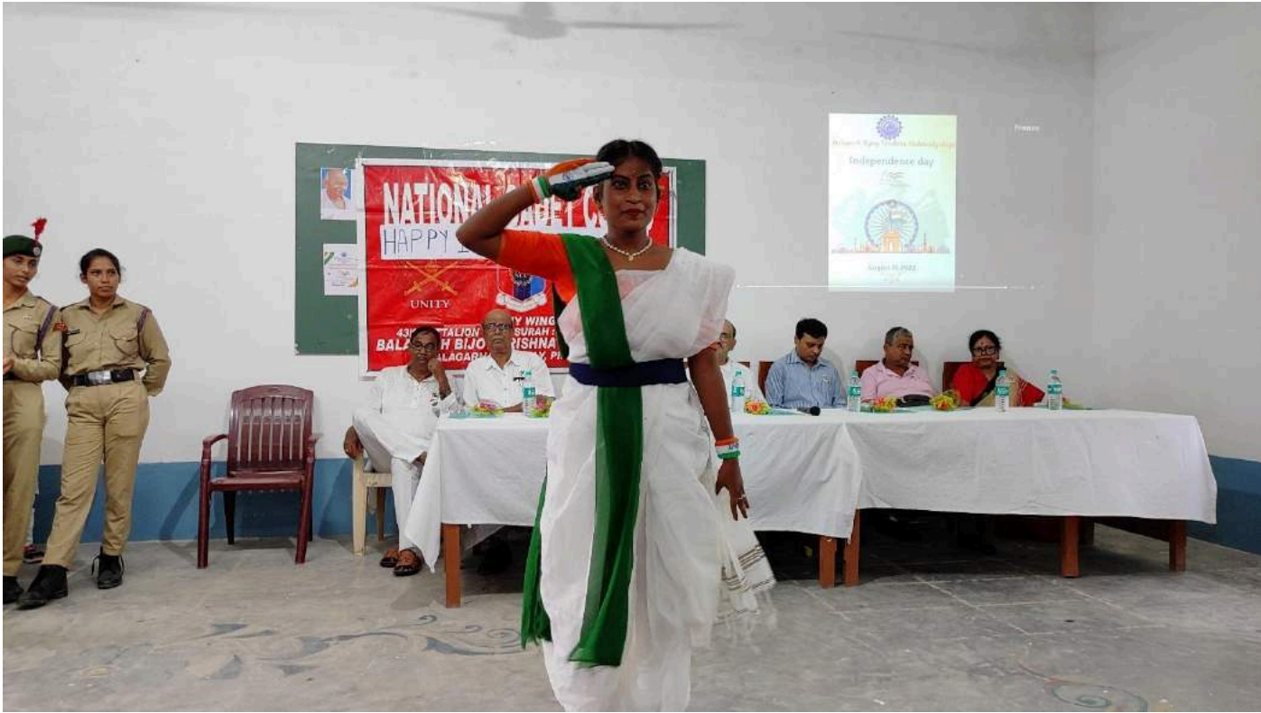
Students who received Kanyashree, are performing