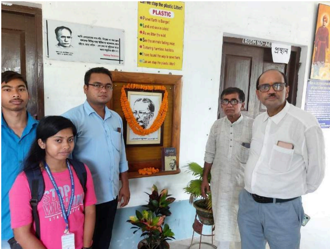
Students and teachers paying respect to the poet Mohitlal Majumder