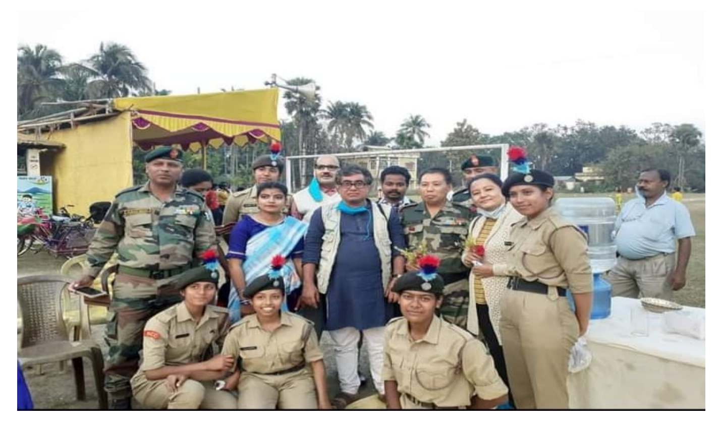
BBKM's Principal, NSS Program Officer, CTO of NCC

'Namami Gange Programme' , is an Integrated Conservation Mission, approved as 'Flagship Programme' by the Union Government in June 2014 with budget outlay of Rs.20,000 Crore to accomplish the twin objectives of effective abatement of pollution, conservation and rejuvenation of National River Ganga. An event was organized to make a strong pitch for public outreach and community participation in the programme as on 21.6.22 & 22.6.22 in the river side Ganga of Balagarh Various awareness activities through rallies, campaigns, exhibitions, shram daan, cleanliness drives, competitions, plantation drives and development and distribution of resource materials were organized and for wider publicity the mass with the assistance of NCC, Battalion 43 of Hooghly. The NCC cadets of this college volunteer of NSS of BBKM, along with NSS Program officer and the Principal of this college participated in two days programs. The Principal requested the attended students' to take endeavors to deploy best available knowledge and resources across the basin for Ganga rejuvenation particularly in this state.