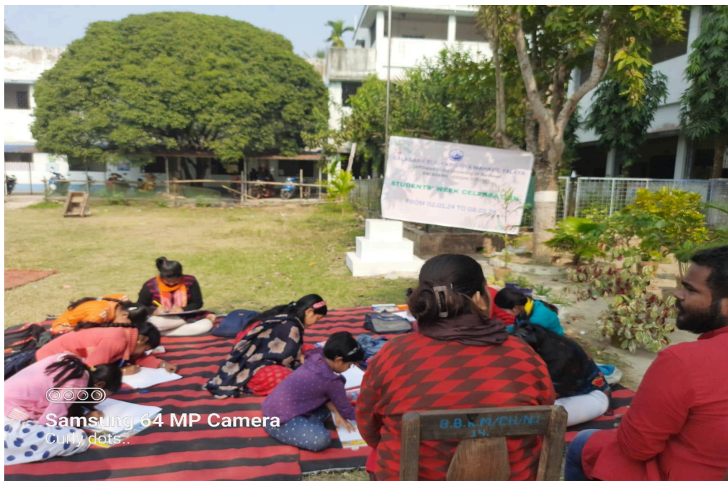
Students participating in drawing competition

The students were encouraged to participate more efficiently in this drawing competition as a part of the cocurricular activities. The number of participants in the programme was 6.