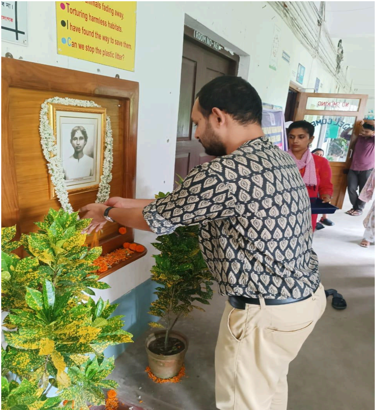
Faculty paying there respect