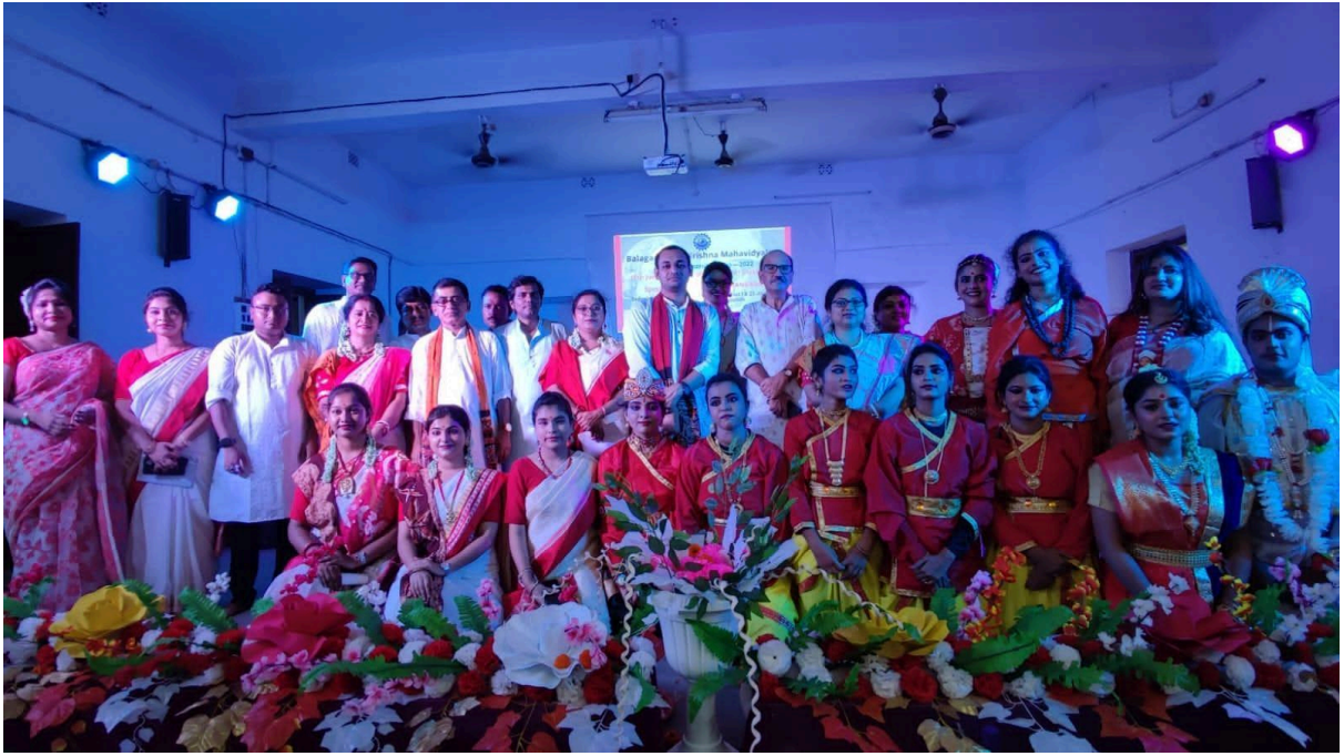
Students and teachers' performance