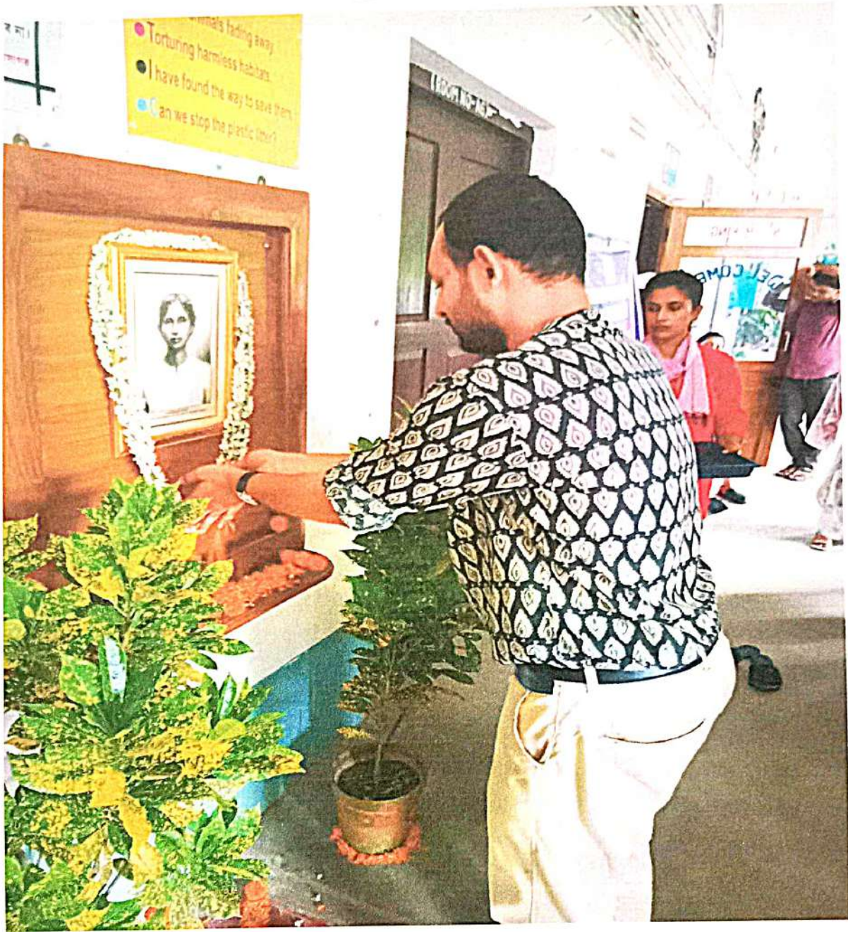
Faculty paying there respect