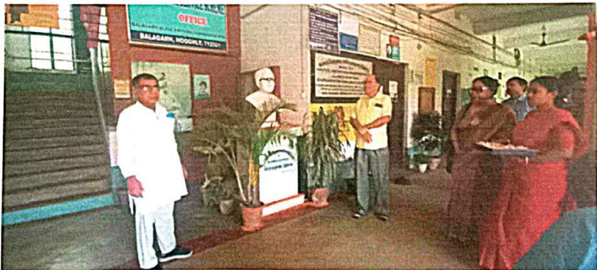
Faculty paying there respect