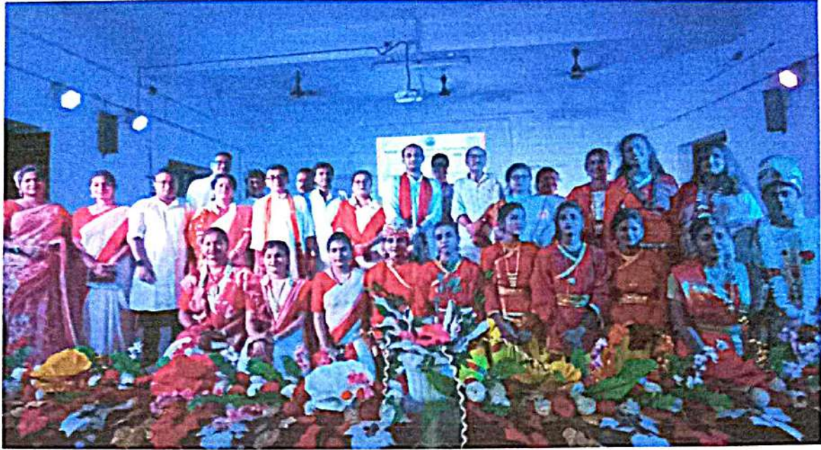
Students and teachers' performance