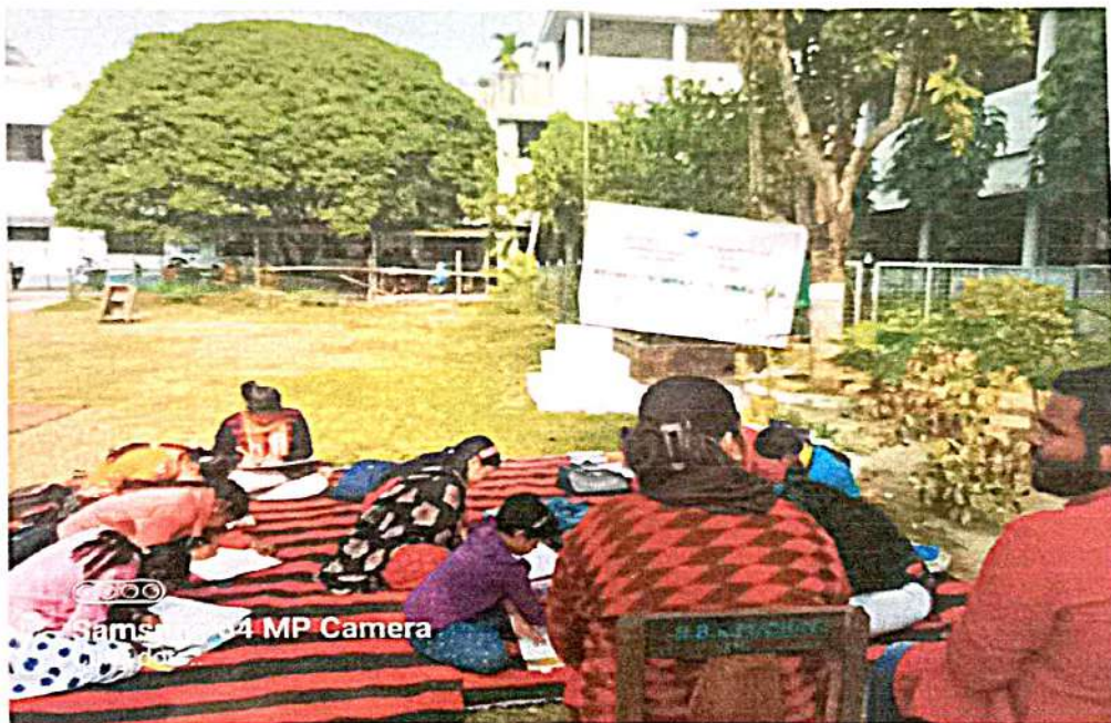
Students participating in drawing competition

The students were encouraged to participate more efficiently in this drawing competition as a part of the cocurricular activities. The number of participants in the programme was 6.