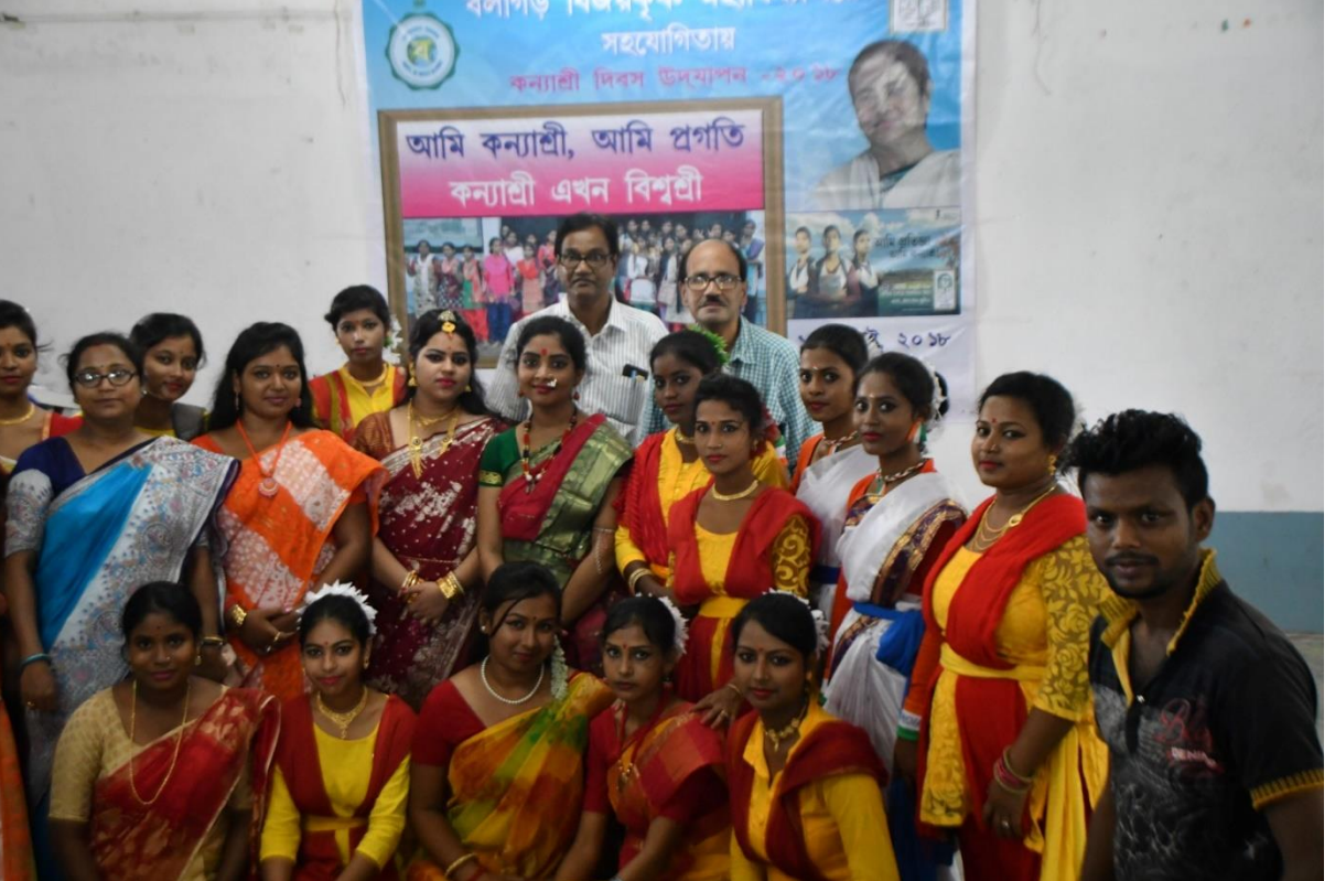
Celebration of kanyashree