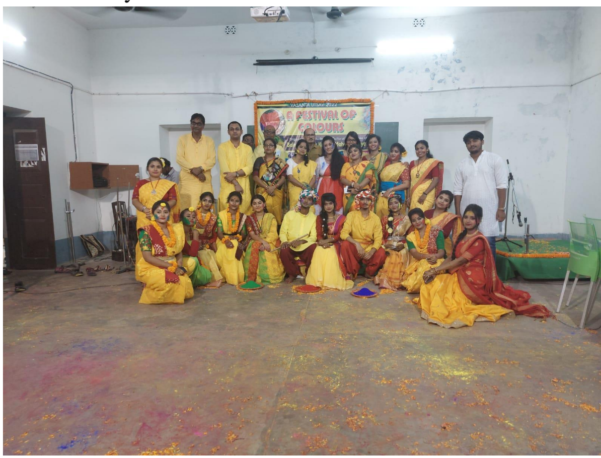
Students And Teachers are celebrating Vasant Utsab

In the college setting, Vasanta Utsav had become a colourful and joyous event organized by students and cultural committee of the college on 20th March 2019 to celebrate the onset of spring. The festival included a variety of activities and cultural performances that reflected the spirit of springtime and Indian culture. The programme began with the welcome address of college principal, followed by various cultural performances showcased by the students.