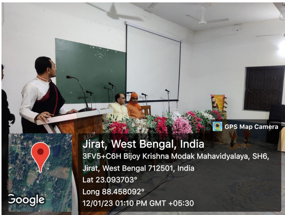
Pic 2. A portrait of Swami Vivekananda