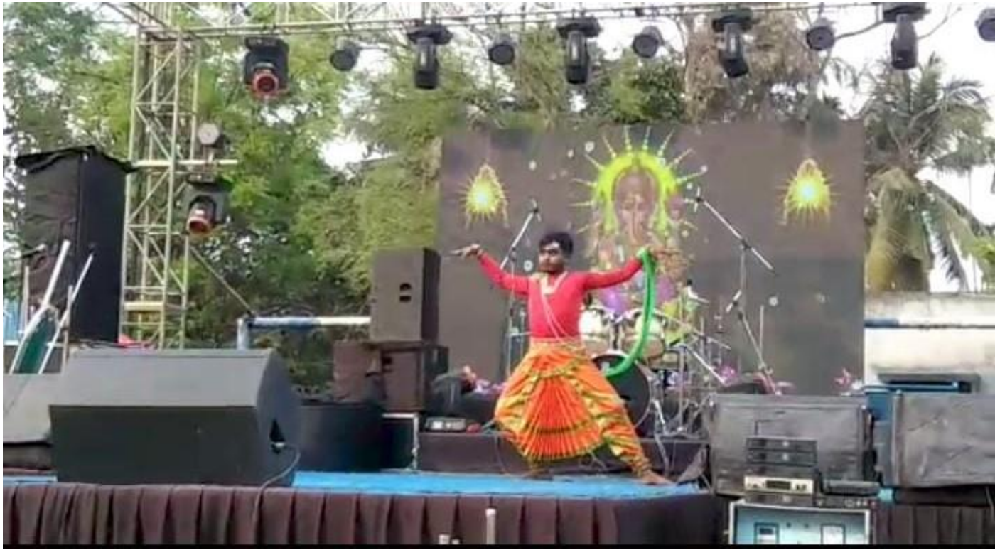
Students performing in annual cultural programme