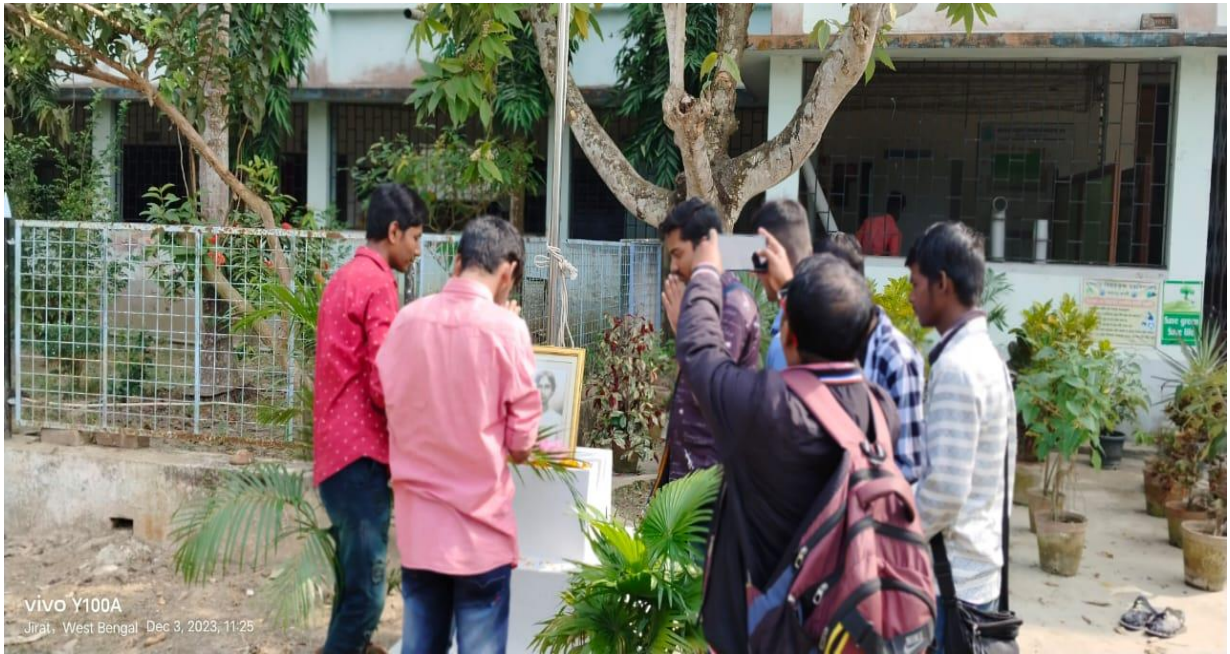
Students paying respect to the freedom fighter