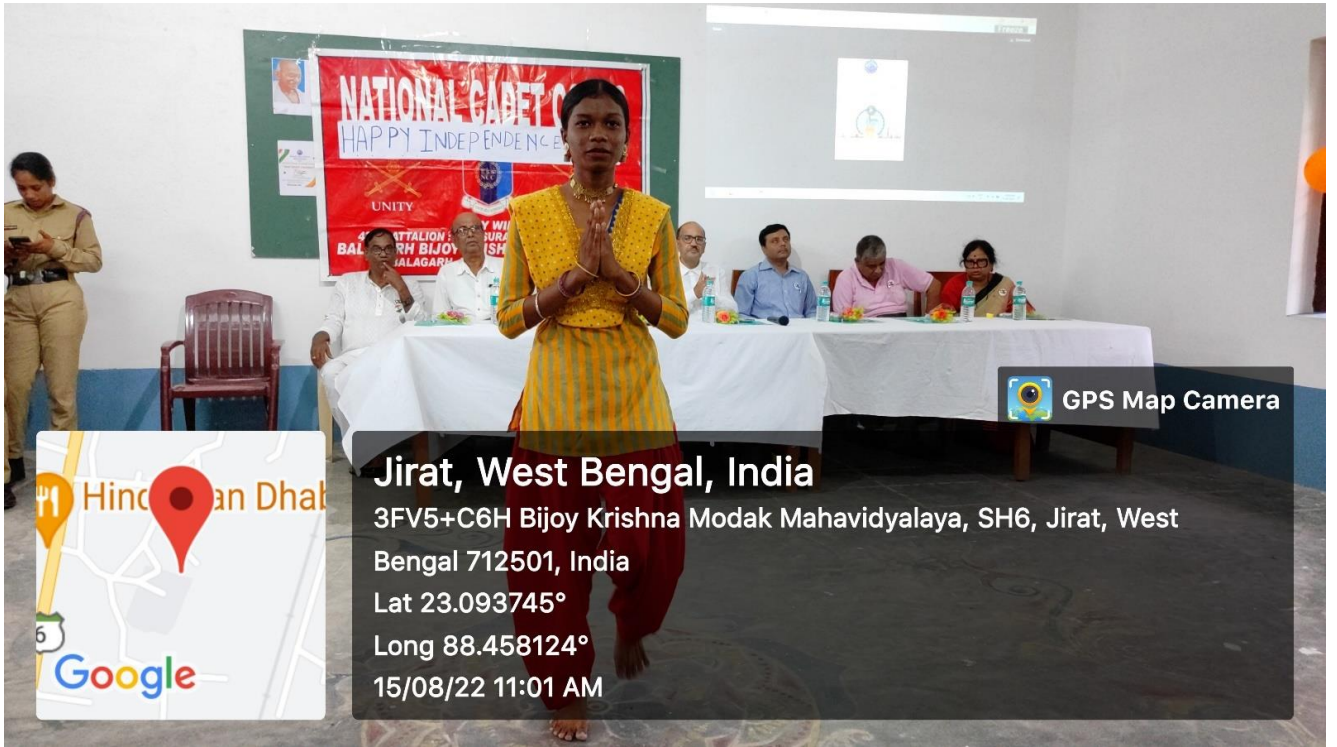
Students Celebrating Independence and Kanyashree