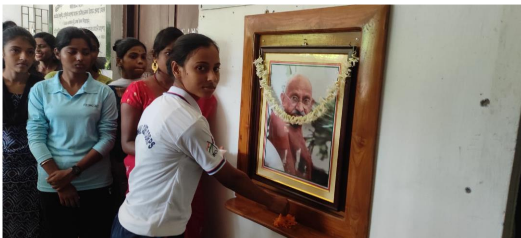
Students paying respect by offering garlands and flowers to the photo of Gandhiji

By organizing a comprehensive and engaging celebration on Mahatma Gandhi's birthday in college, students were able to deepen their understanding of his timeless principles and strive to embody his values of truth, non-violence, and social justice in their personal and collective endeavors.