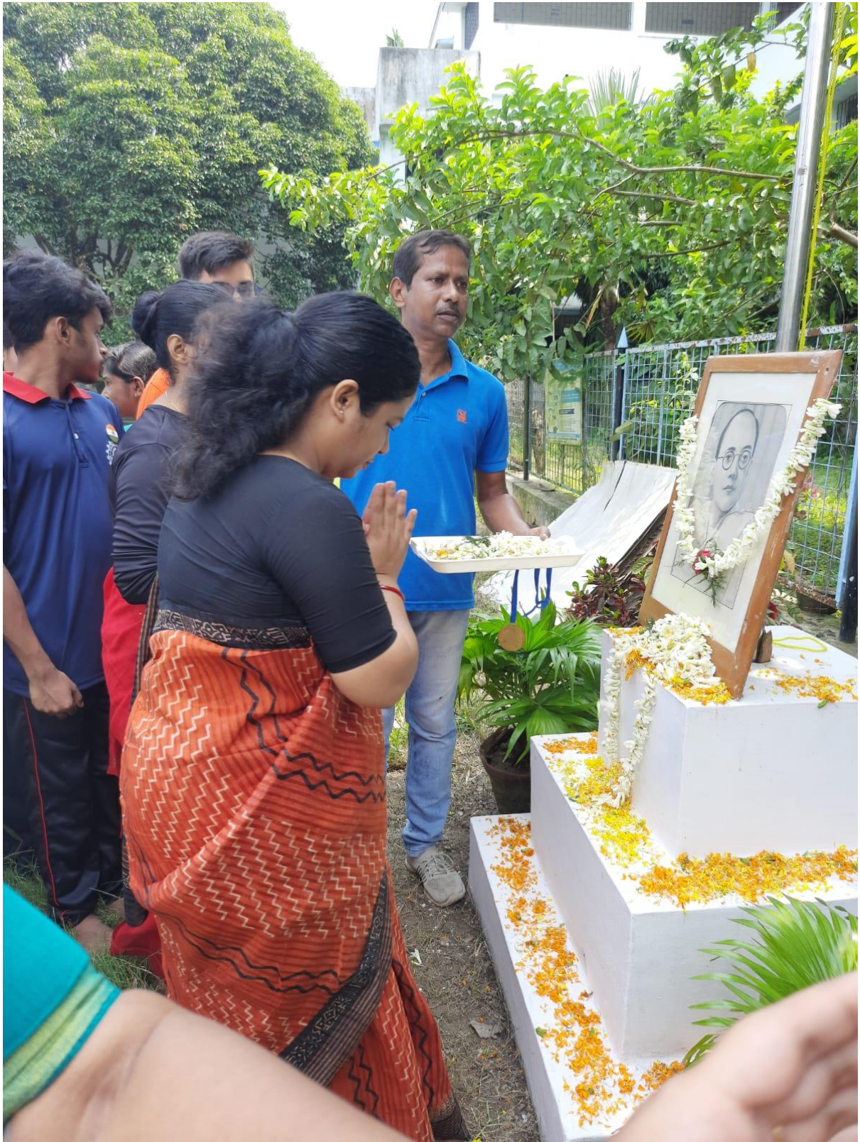
Students and Teachers paying respect