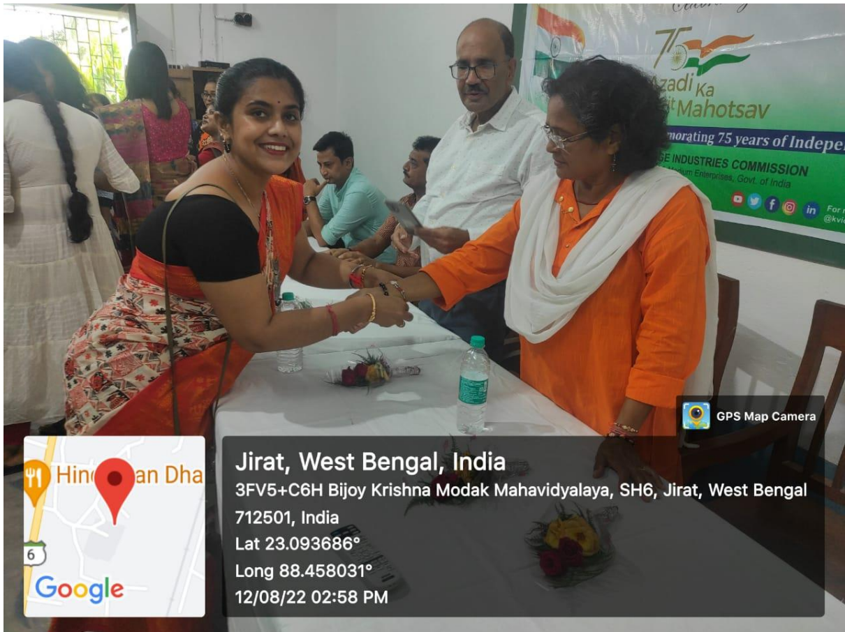
Students and teachers tying rakhi to each other