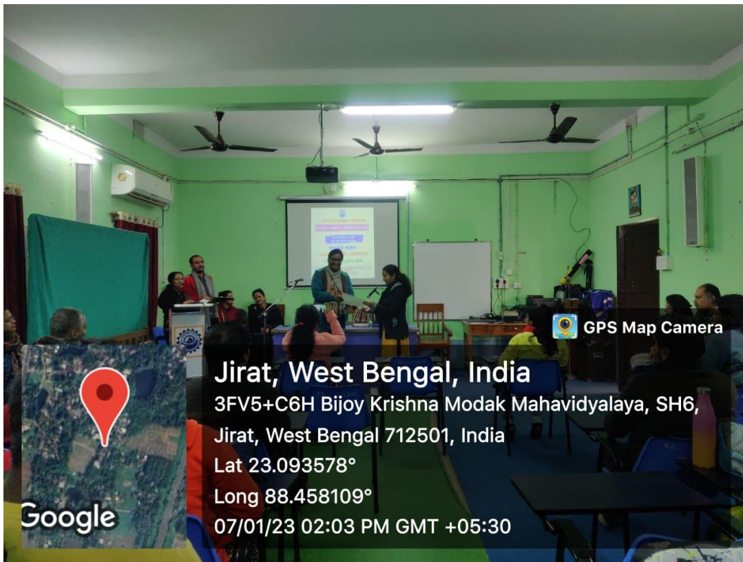
Students receiving certificate of participation