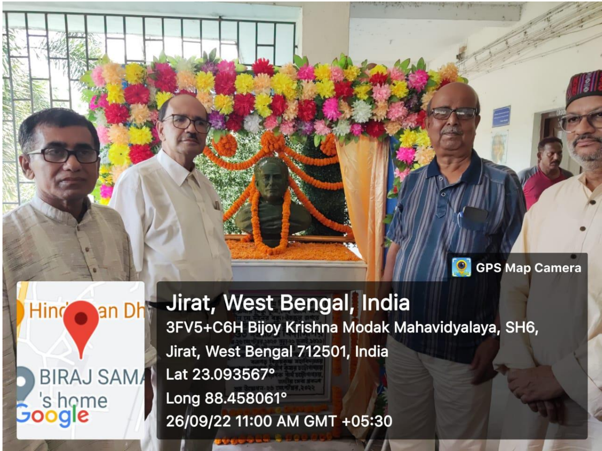
Students, faculties and the principal of the college paying respect