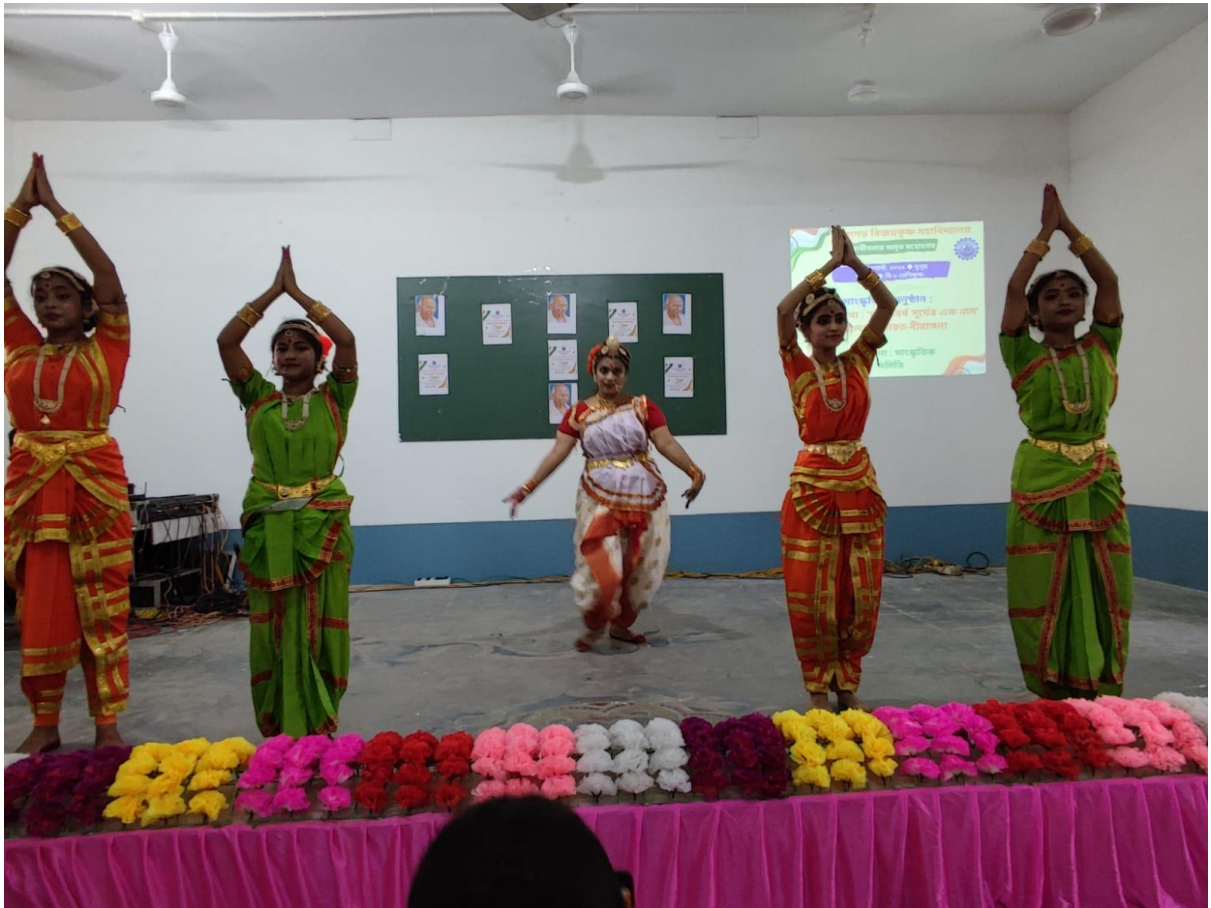
Students and teachers performing