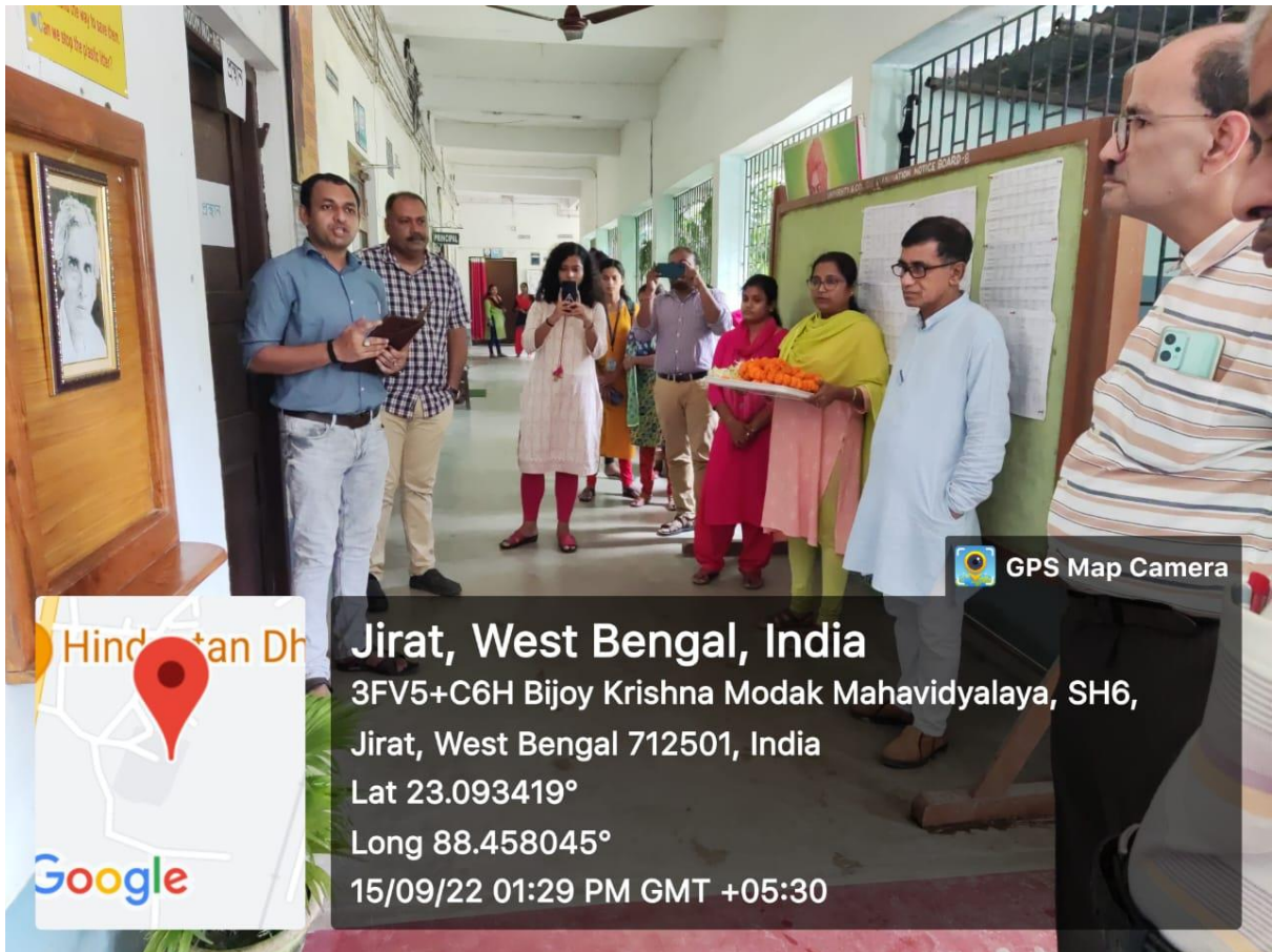
Students, faculties and College principal paying respect to the eminent Bengali author by delivering speeches