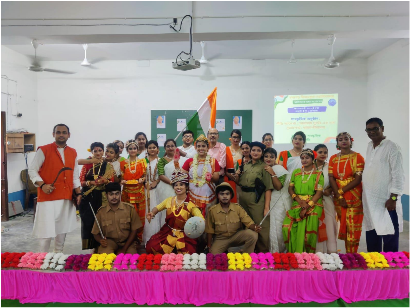
Students, faculties as performers