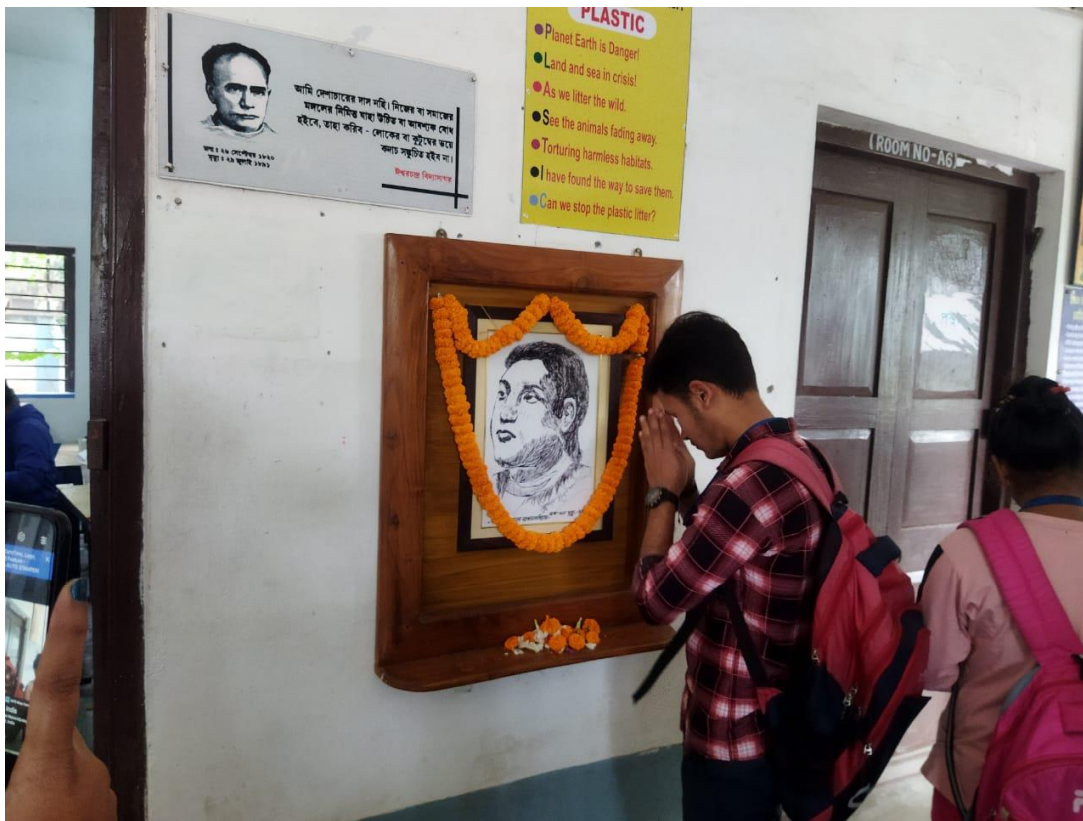
Students paying respect to the poet

Rangalal Bandyopadhyay’s birth anniversary is celebrated with offering garlands on the photo of the renowned Bengali poet, along with opening speeches given by the college principal and poetry readings and speeches delivered by student participants and faculties. The number of participants was 3.