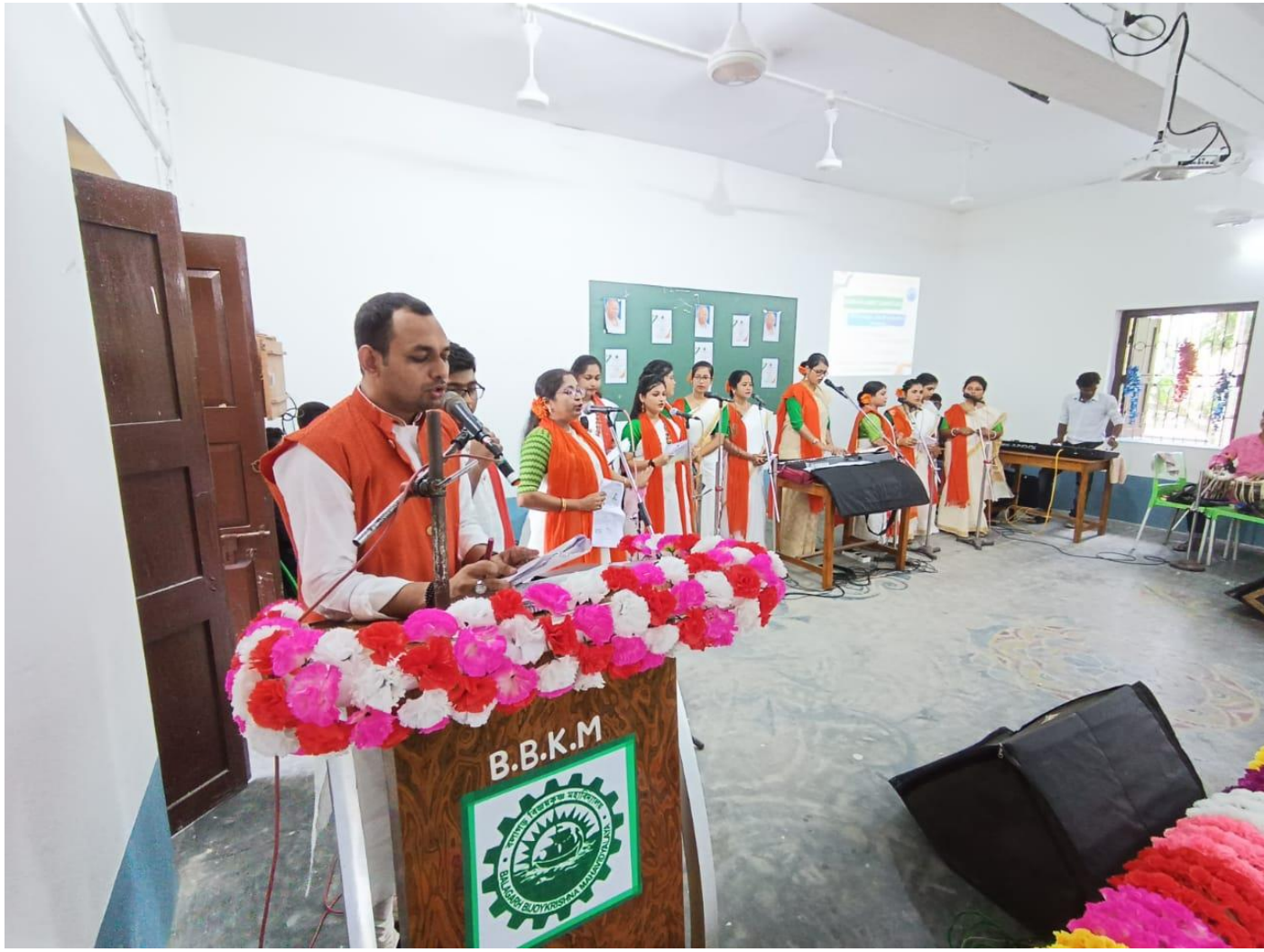
students and teachers performing