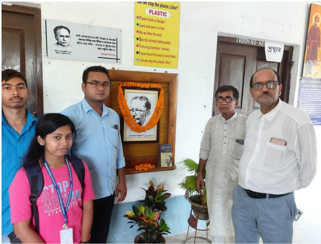
Students and teachers paying respect to the poet Mohitlal Majumder