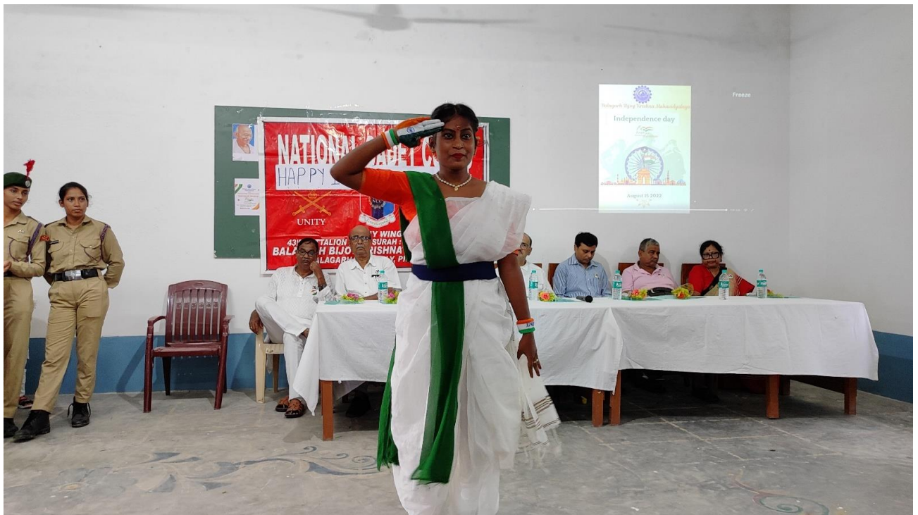
Students who received Kanyashree, are performing