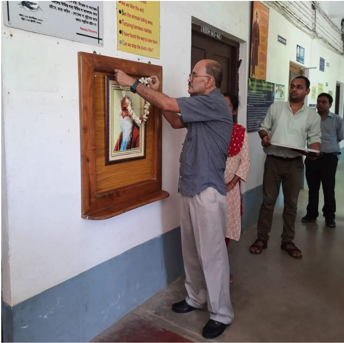
The principal of the college offering garland to the poet Rabindranath Tagore