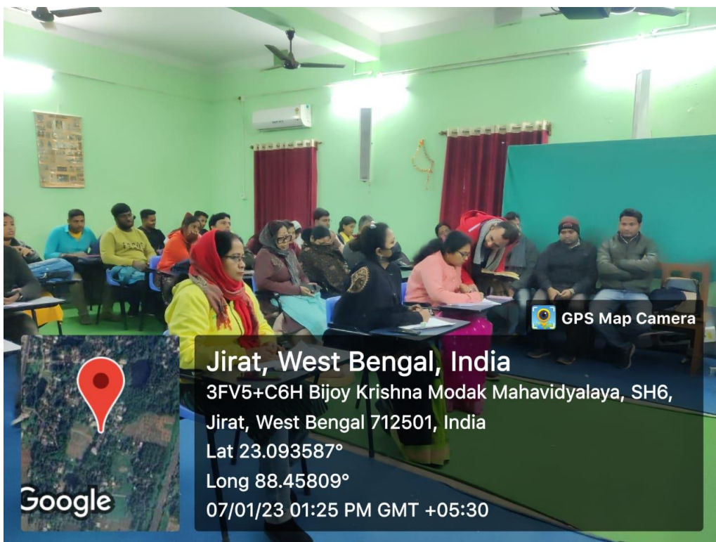
Students participating in Competition