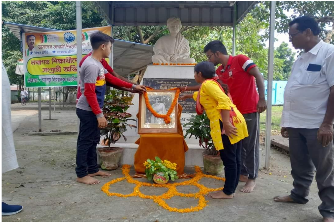
Students paying respect to the social reformer