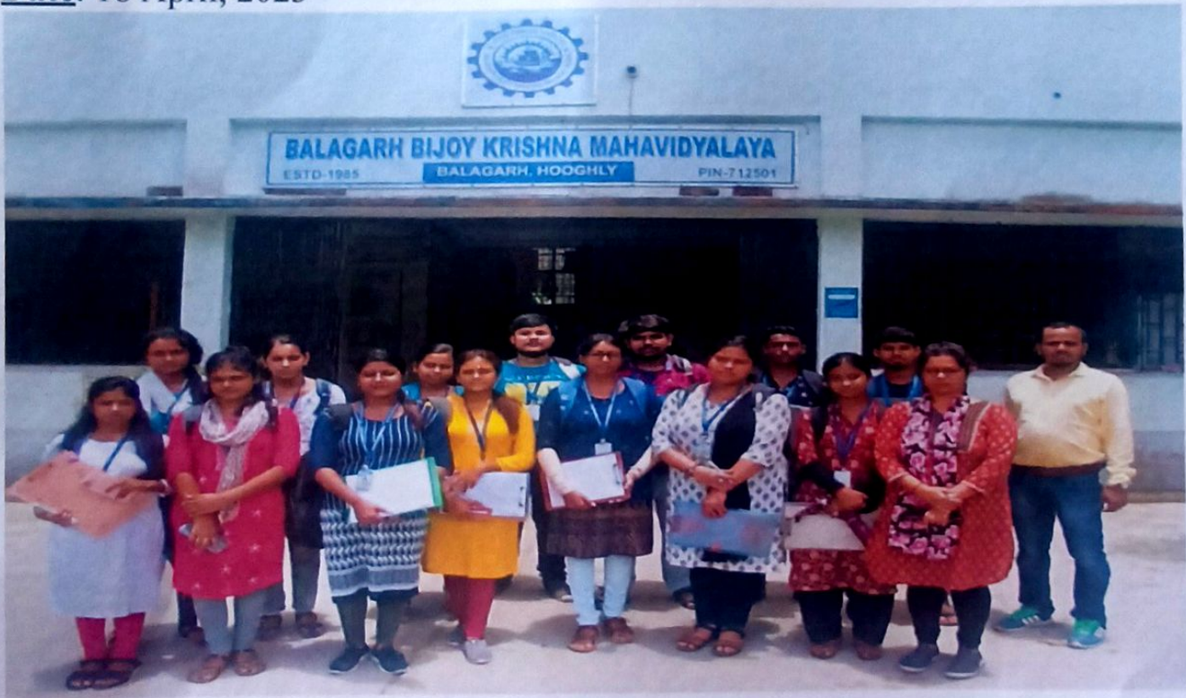
Field Survey Group