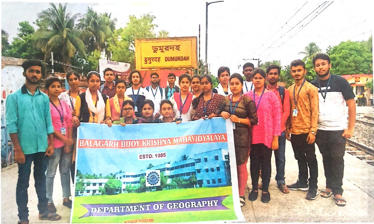
Field Survey Group