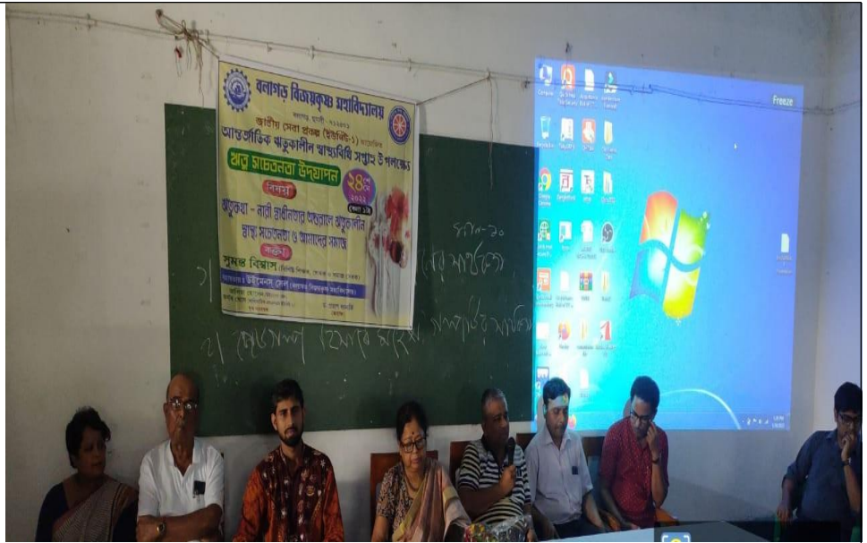
OUR HONOURABLE TACHERS OF BBKM AT THE DIAS. ON 24.05.2022