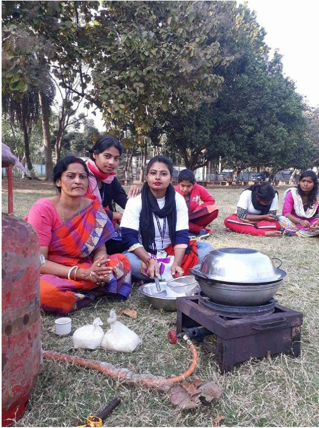
College Students is getting training on pickle preparation at Balagarh Bijoy Krishna Mahavidyalaya' s Campus as on 3rd October, 2019.