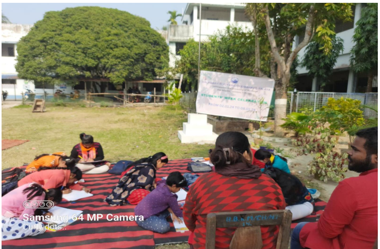
Students are participate in drawing competition

The students were encouraged to participate more efficiently in this drawing competition as a part of the cocurricular activities. The number of participants in the programme was 6.